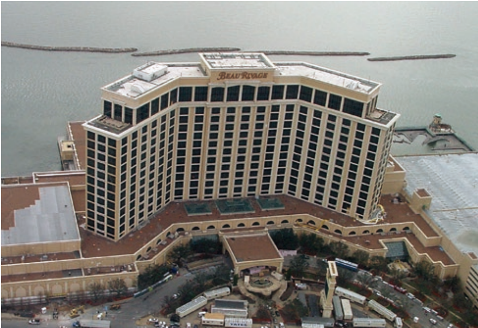
BEAU RIVAGE CASINO, BILOXI, MS, USA

Construction year: 2006 Loose laid roof system using 80 mil Sarnafil® G476 water- proofing membrane