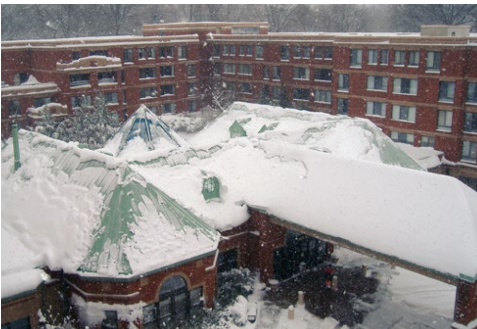
HYATT CLASSIC RESIDENCE, TEANECK, NJ, USA

Construction year: 2006 Decor Roof System using ad- hered 60 mil Sarnafil® G410 membrane in patina green color