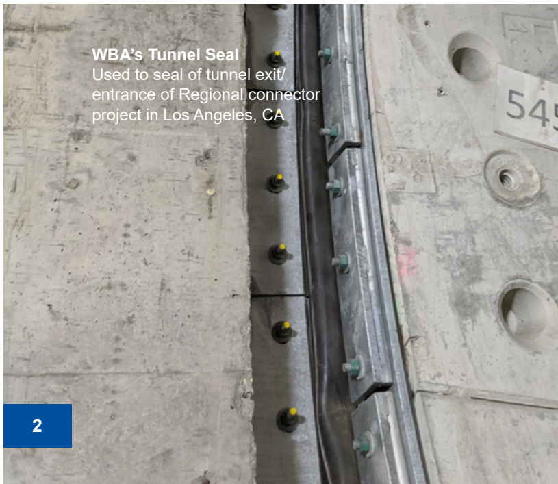
WBA's Tunnel Seal Used to seal of tunnel exit/ entrance of Regional connector project in Los Angeles, CA

Watson Bowman Acme is 100% focused on expansion joints, sealing and water-protectant technologies