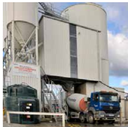
ADMIXTURES FOR CONCRETE AND SHOTCRETE

Sika provides a single source for integrated and compatible solutions from basement to roof in the following areas: