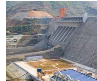
3. Spillway & Intake Structures, Page 13