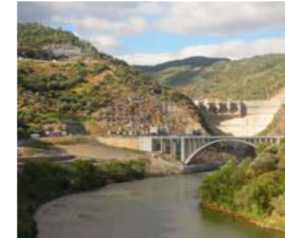
1. Main Dam, Page 10