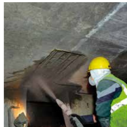
CONCRETE PROTECTION AND REFURBISHMENT