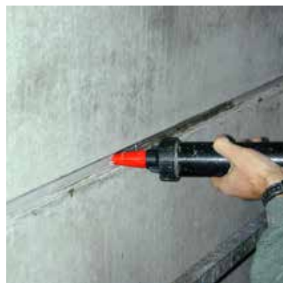
SEALING, BONDING AND STEEL PROTECTION