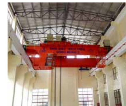
5. Powerhouse, Page 16