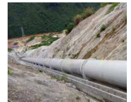
6. Penstock & Gates, Page 17