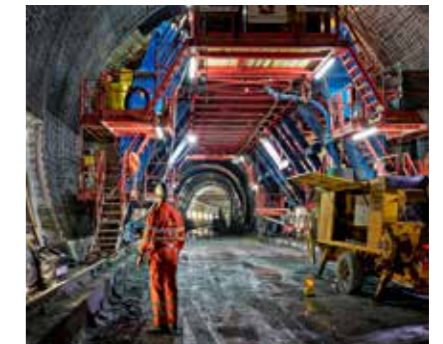
4. Underground Works, Page 14