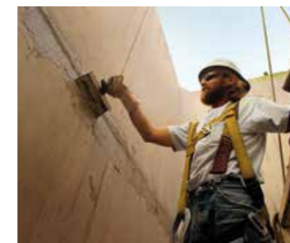
7. Dams Refurbishment, Page 18