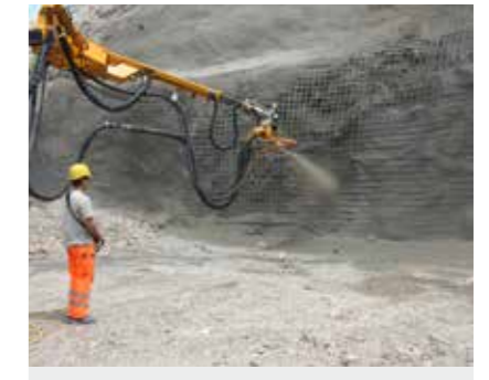
2. Slopes Stabilization, Page 12