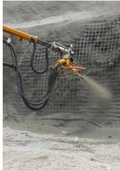
shotcrete and these are also important for ensuring future stability.

One of the many applications of shotcrete is slope support. Slopes are generally designed so that the rock mass can support itself, but frequently this requires additional support. Shotcrete is also ideal for slope stabilization due to its ease of adaptation to site profiles and requirements, its capacity to stick to the rock and its high early strength and resistance. As shotcrete is spray applied, the material is compacted against the surface to also fill any cracks and prevent any loose materials from falling. Shotcrete therefore provides a protective coating over the slope's surface and also helps to consolidate and stabilize or 'anchor' the surface. In addition, drainage systems such as Sika FlexoDrain can be fixed into and onto the slope with