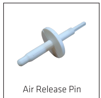
Air Release Pin