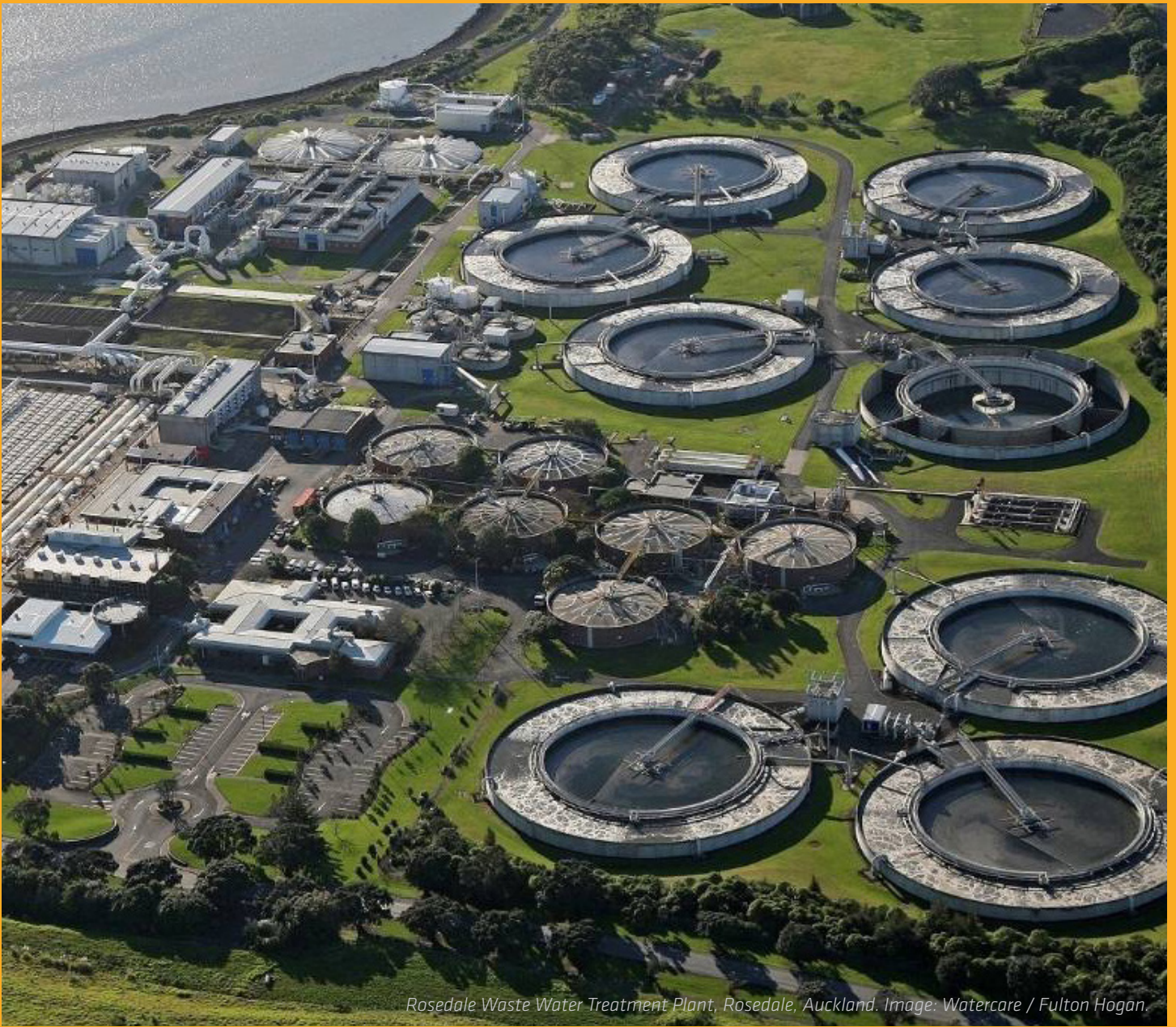
Rosedale Waste Water Treatment Plant, Rosedale, Auckland.