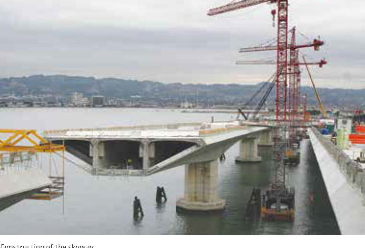
Construction of the skyway