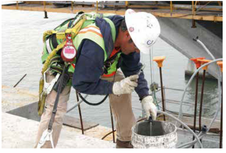
Grout coming out of the air pipe