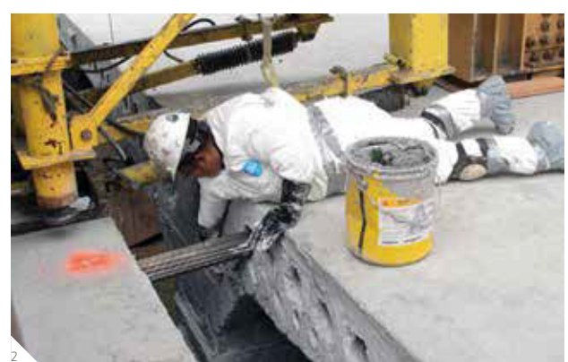
1 Concrete segment 2 Application by hand of Sikadur®-31 SBA 3 Applied Sikadur®-31 SBA