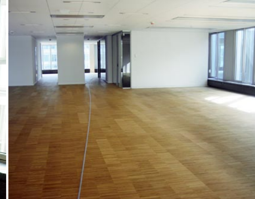
Big area with industrial parquet