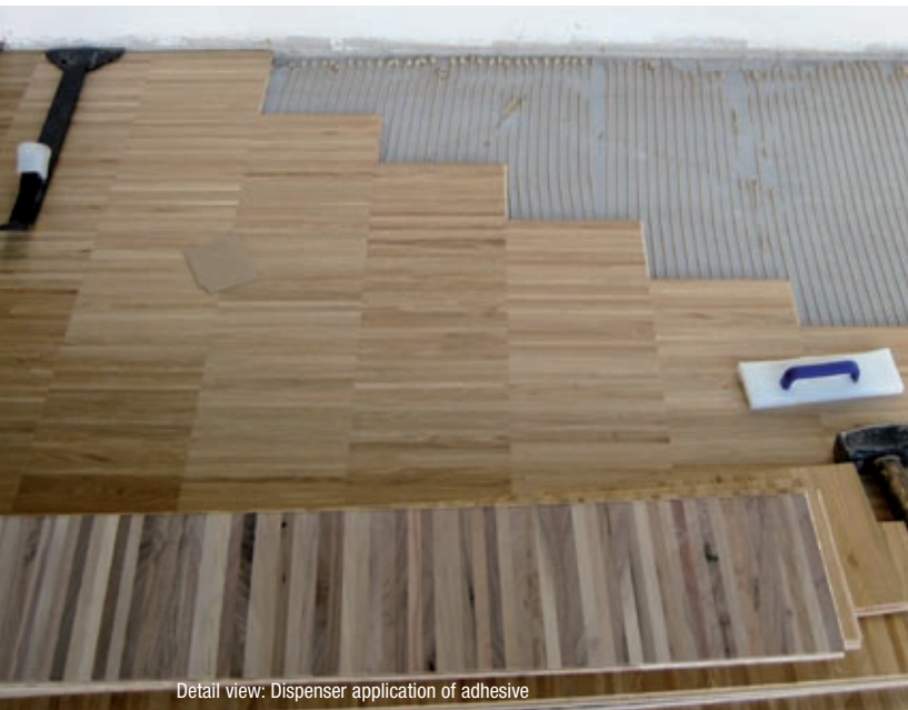
Detail view: Dispenser application of adhesive