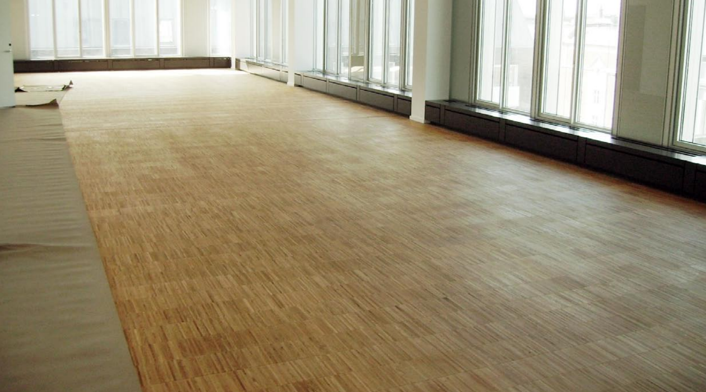
New installed industrial parquet