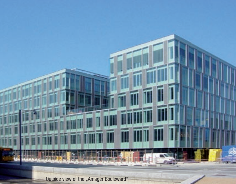
Outside view of the „Amager Boulevard“