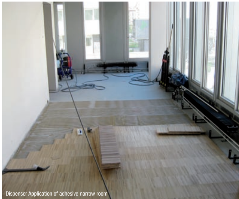
Dispenser Application of adhesive narrow room