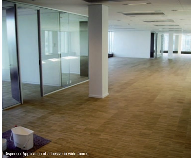
Dispenser Application of adhesive in wide rooms