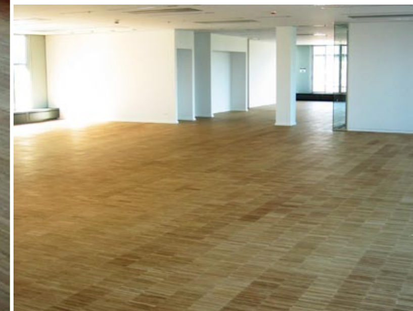
Dispenser application of adhesive