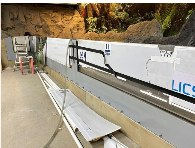
Lobster tank – Viewing glass and frame positioned on nib formed with Sika Monotop-438 R bonded with Sikadur-32. SikaSwell A bonded with SikaSwell S-2 used between nib and concrete base. Sikaflex-11 FC used as a gasket seal between Sika Monotop-438 R nib and steel frame.