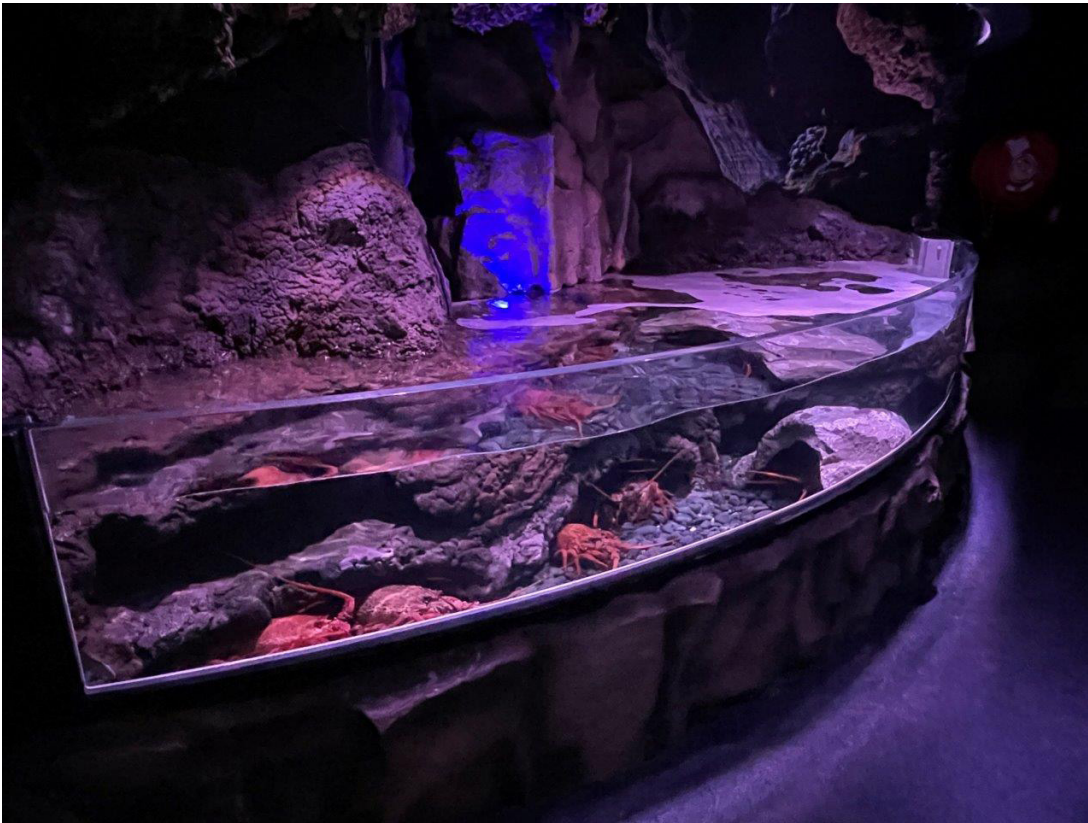
The new Sea Cave adventure exhibiton is home to the long fin eel and NZ's packhorse lobster.