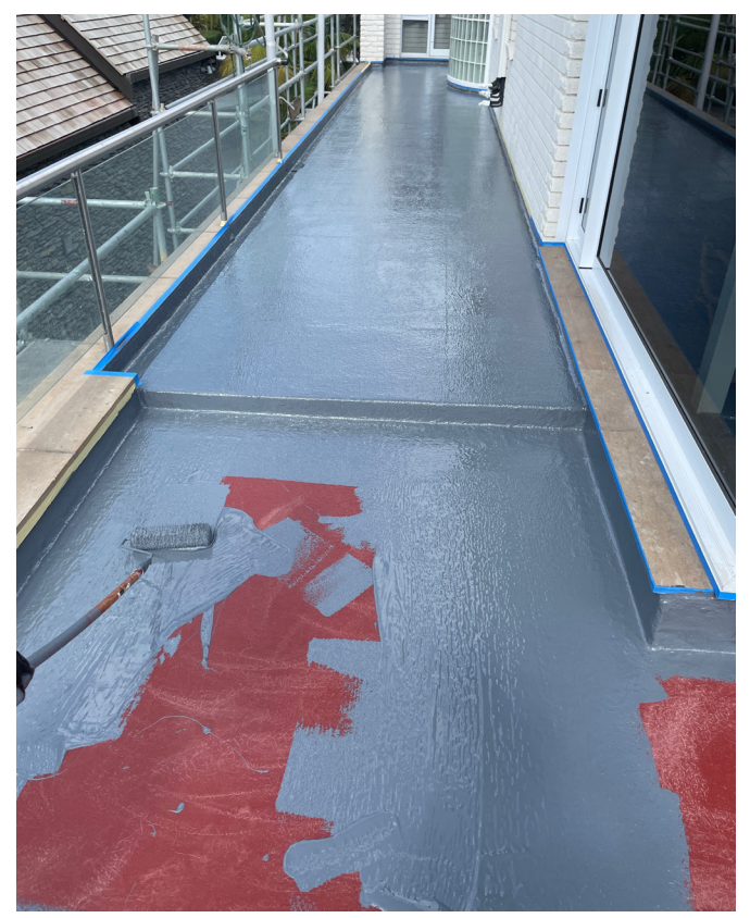
SikaRoof® i-Cure's top coat (Sikalastic®-641) been applied over the system base coat (Sikalastic®-631). East side of house.