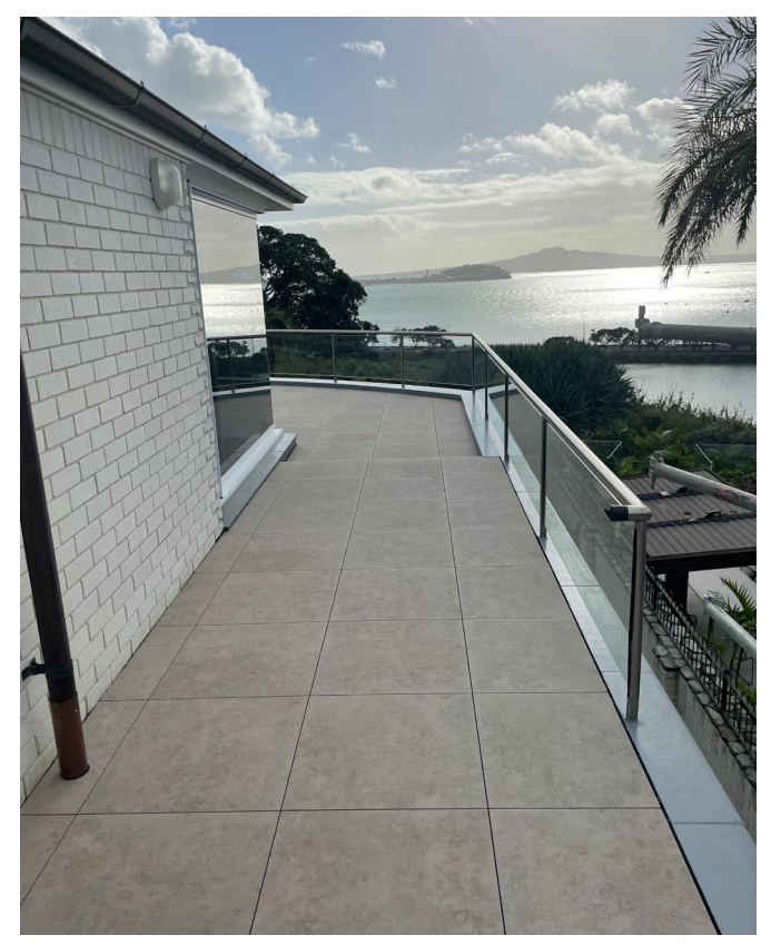
End result - East side of house.