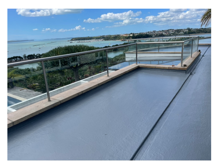
SikaRoof® i-Cure-22 system applied over SikaScreed®-1 on concrete balcony deck over habitable space below.