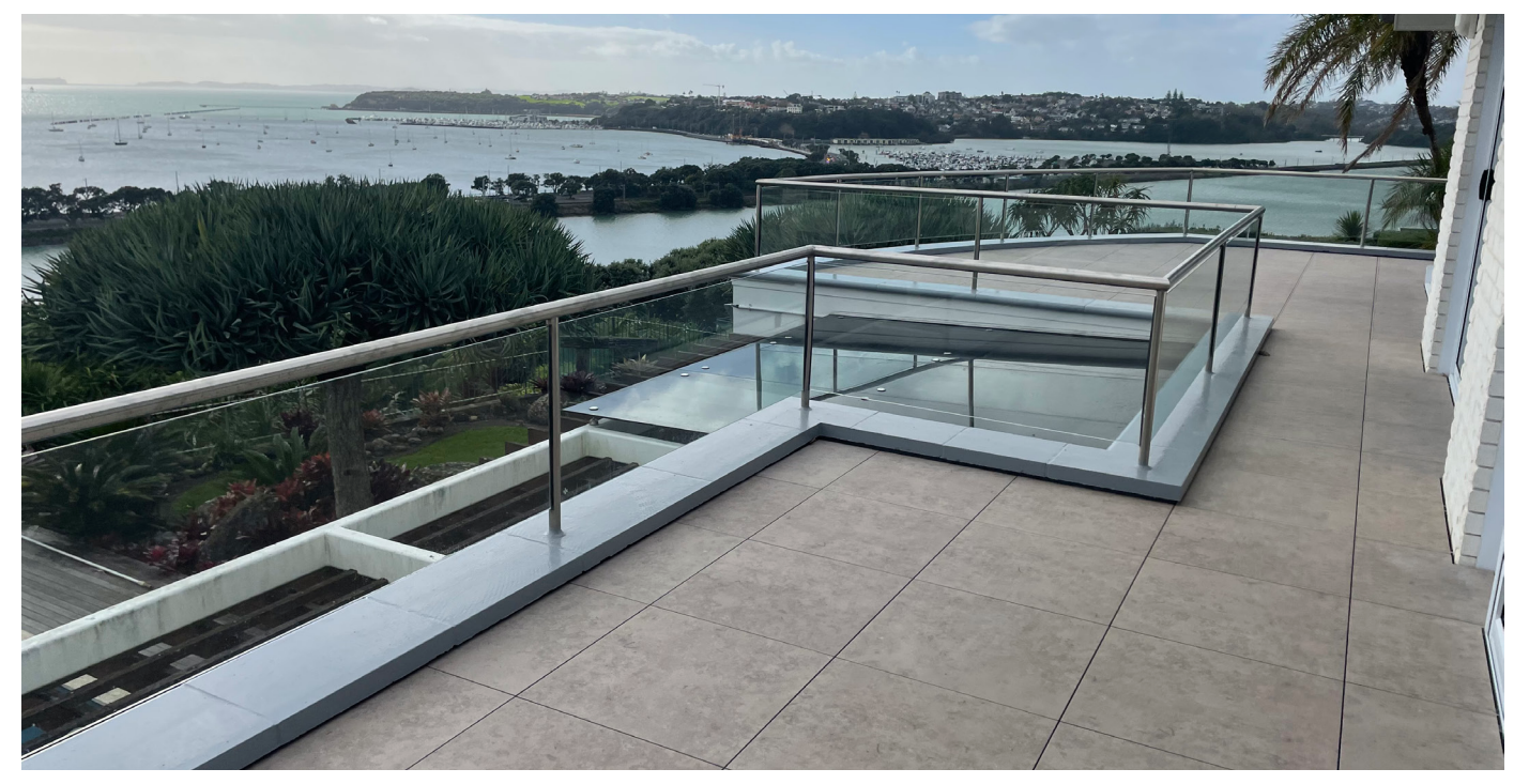
Finished deck with tiling on pedestals over the SikaRoof<sup>®</sup> i-Cure-22 system.

Sika (NZ) Ltd 85-91 Patiki Road, Avondale · Auckland 1026 · New Zealand