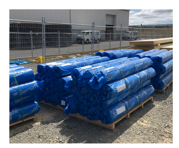
Sarnafil 410-20 L Felt

Main Contractor: Apollo Projects Specialist Contractor: Access 2005 Limited