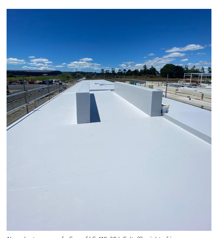
New plant room roof - Sarnafil G 410-20 L Felt. (On right of image, new cool room at floor level not build yet)