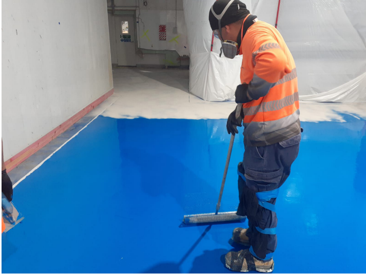
Sikafloor®-21 PurCem being installed