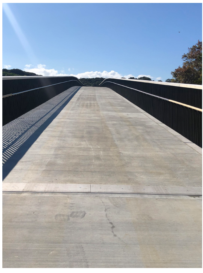
Completed photo: Specialist Contractor Chelsea Corp installed high performance expansion joint system Emseal SJS