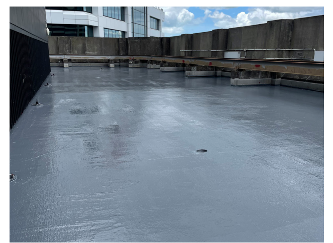
{\it Completed.}\ {\it A seamless, waterproof membrane.}