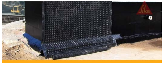
Minimum 100mm diameter drainage coil Minimum fall of 1 to 200