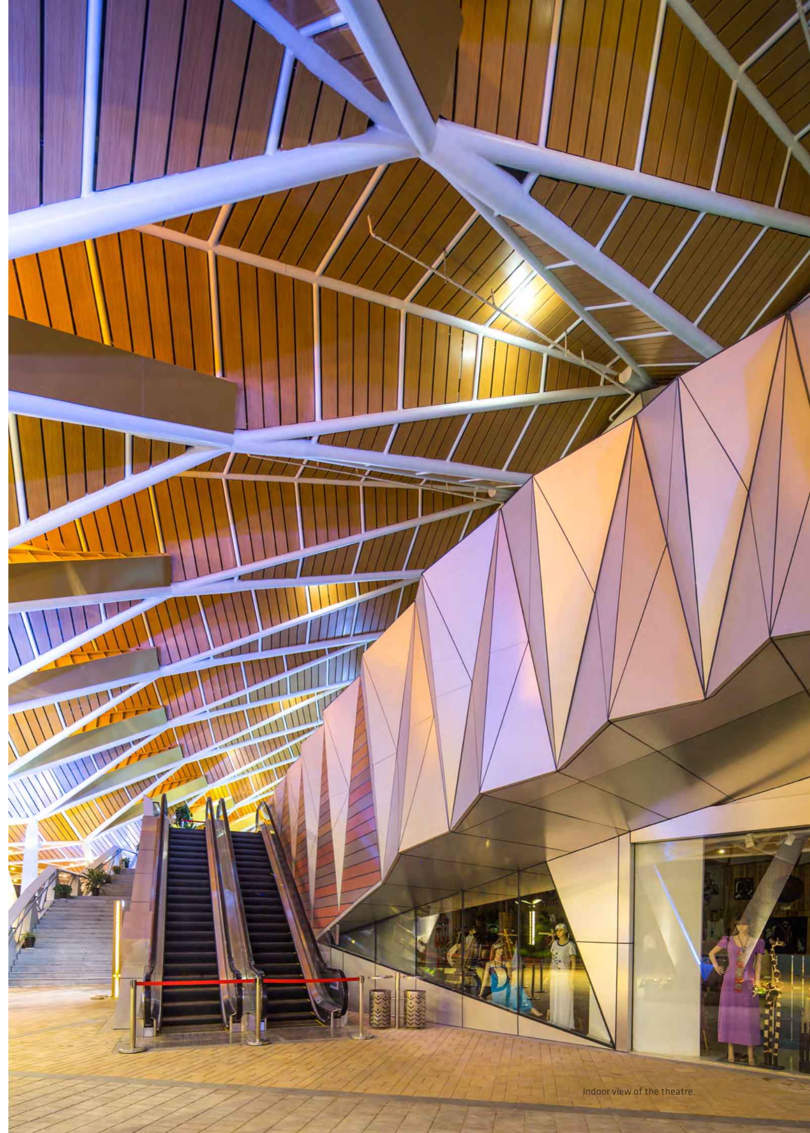
Indoor view of the theatre.