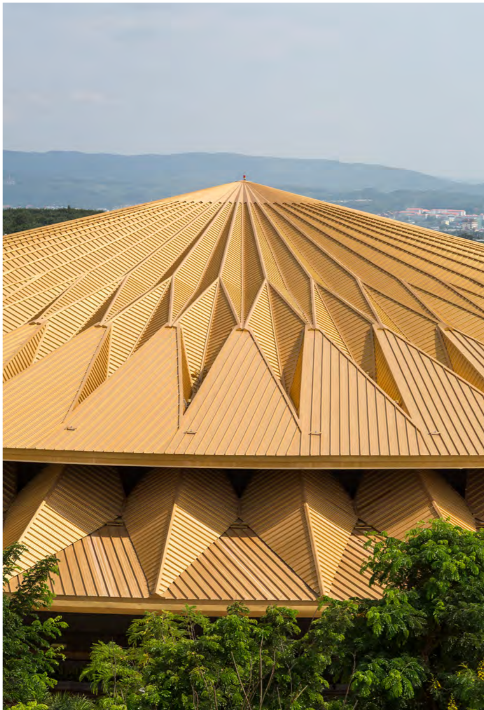
The architectural design of the theater has a strong tropical rainforest influence

The architectural design of the theater has a strong tropical rainforest influence. Given the building’s resemblance to the straw hats often worn by Dai girls, the theater is nicknamed “golden straw hat”. Inspired by the geometrical form of palm leaves common in tropical areas, the de-