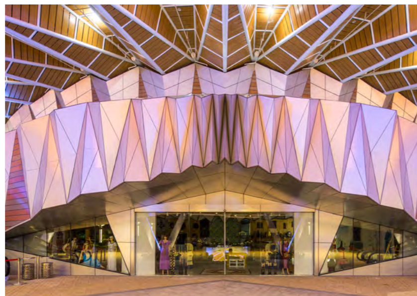
Today, the Dai Show narrates the ancient and mysterious love stories of the Dai people to tourists.

Today, the Dai Show narrates the ancient and mysterious love stories of the Dai people to tourists every day and represents the mysterious rainforest life and beautiful Dai myths through the medium of modern technologies and spectacular performances. While tourists come and go, the "golden straw hat" and the Sika roof waterproof system, the theater's silent protector, will remain permanent features of the rainforest. <