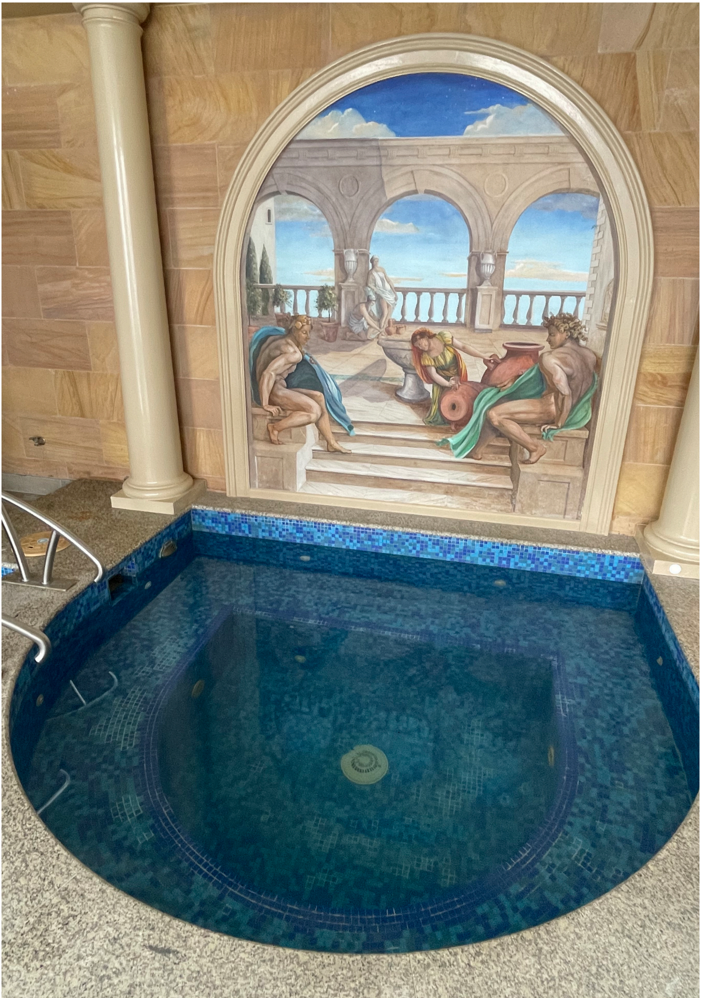
Completed photo of the spa.