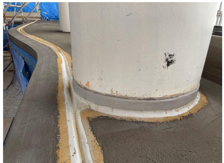
Sikadur® Combiflex® SG applied over expansion joints around the pool area.