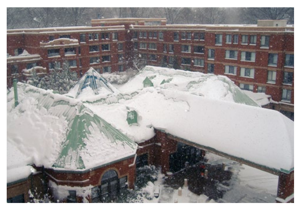
Construction year: 2006 Decor Roof System using adhered 60 mil Sarnafil® G410 membrane in patina green color

HYATT CLASSIC RESIDENCE, TEANECK, NJ, USA